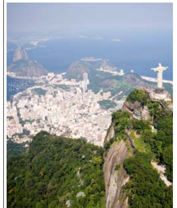
The Portuguese translation headed for Brazil.

"We invite those of you reading this newsletter to submit names of people you consider the leaders and teachers of the future."