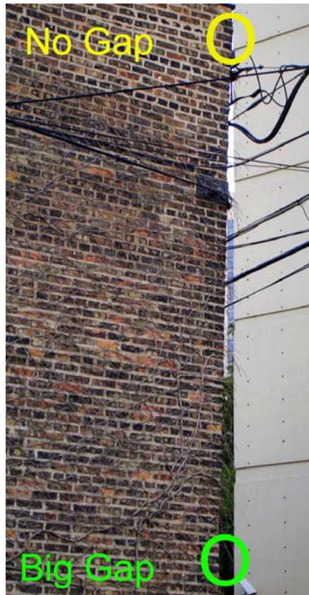
The leaning Carriage House

The spiritually hungry people in our world cry out for the transformative truths contained within our beloved Urantia Book .