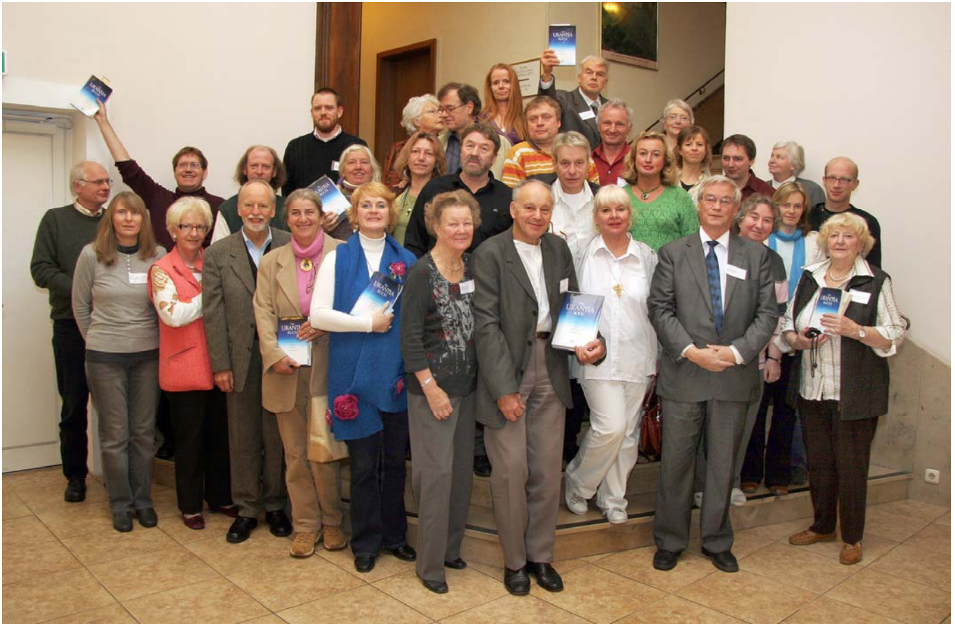
The new German reader community.