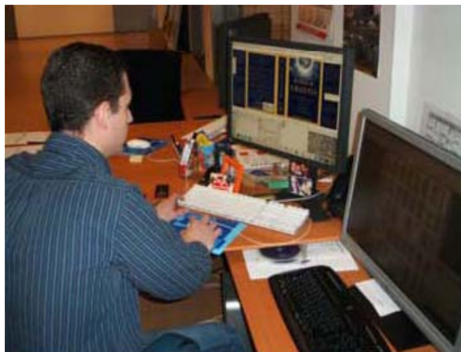
Pre-press operation and plates flashage