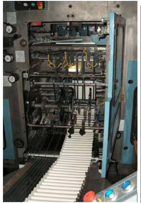
Folios are conditioned for the binding mill