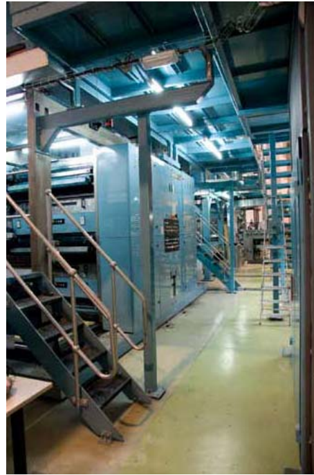
SIMSON Press ground level