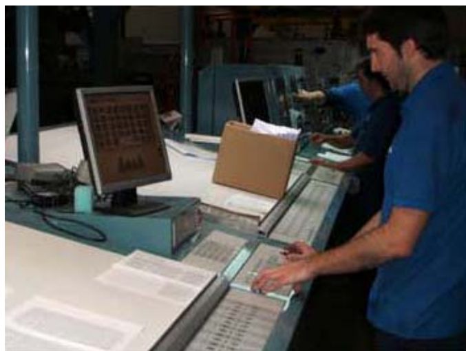
Preparation and checking first pages