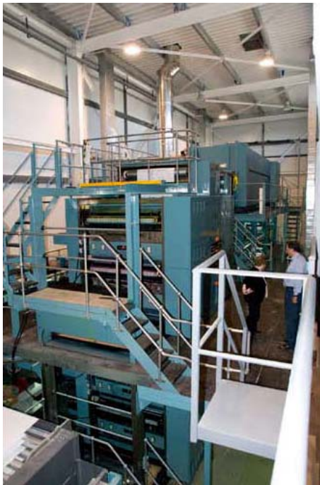
SIMSON Press upper level