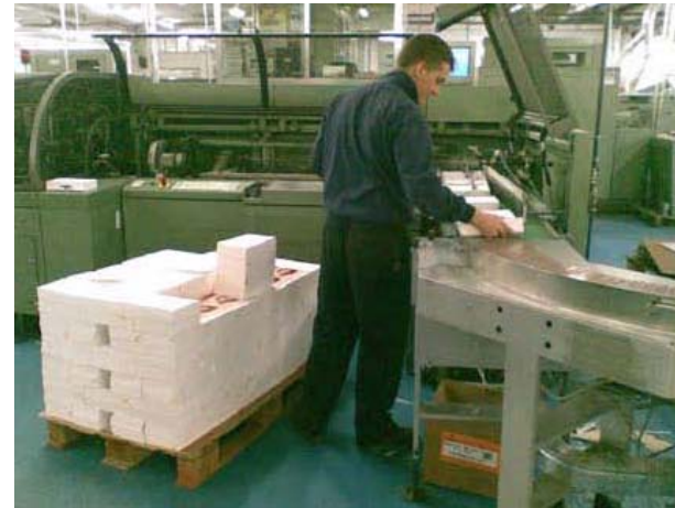
Shrink-wrapping the books for distribution