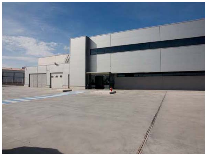
Rotabook Printing Mill