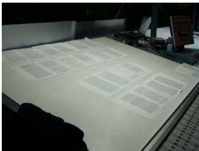
Preparation and checking first pages