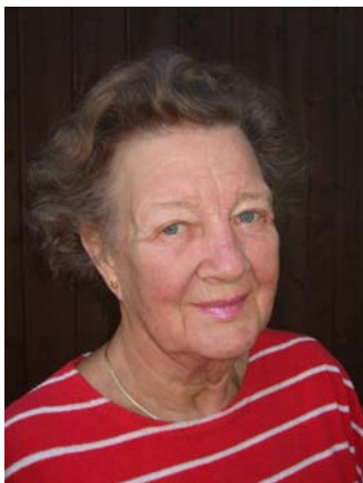
By Irmeli Sjölie, Associate Trustee, Helsinki, Finland

Editor's Note: Over seven nights and six days, from December 3 – 9, 2009, the Melbourne Parliament welcomed over 6,500 people representing over 200 religious and spiritual traditions from more than 80 countries. Attendees chose from over 550 programs, including daily observances, intra- and inter-