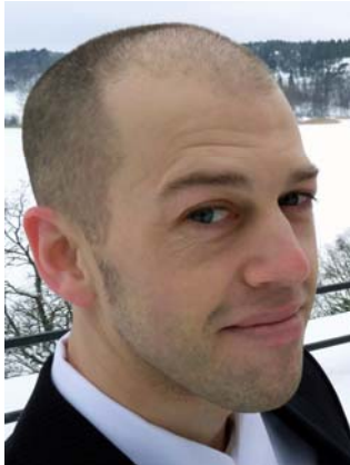
By Jacob D, Stockholm, Sweden

Ask anyone who lives in Sweden, and they will agree with the statistic that Sweden is the most atheistic country on the planet. It is the secular capital of the world, and by "secular" I mean "life without the presence of God." God has been pushed out of everyday living. A number of Sweden's public figures even boast that religion is a dying aspect of humankind's superstitious age, that religion is nearly removed from this ideal humanistic society, and the daily drone of religion-bashing goes on in newspaper articles. In fact, the Swedish people have gone so long without religion as a topic of